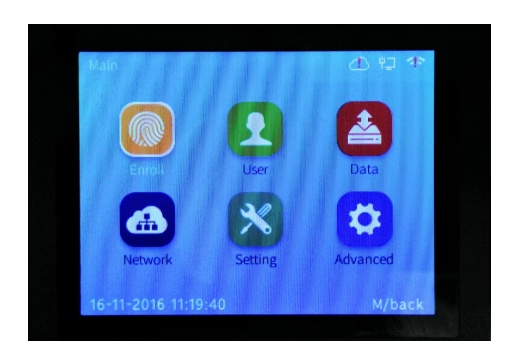
Pic 1. Main menu