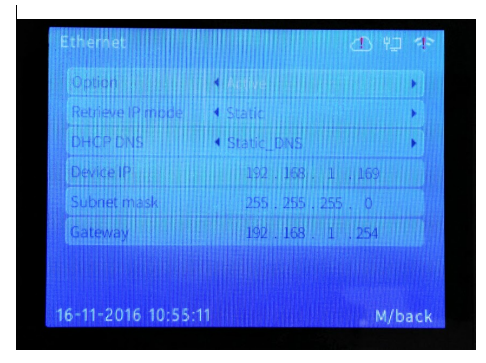
Pic 2. Ethernet settings

Once this is done we need to go back to the computer/server so that we can pair the software with the device. Refer back to the main document until instructed.